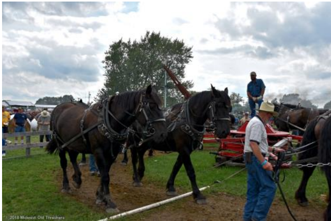
Teams of horses work the baler during the 2018 Reunion

The Horse Area has an especially unique ability to find reasons to gather together and work. Unlike a steam engine, tractor, stationary engine, or antique vehicle, horses must be fed and worked every day, if they are to stay healthy and physically fit in order to put on a good show during the Reunion.