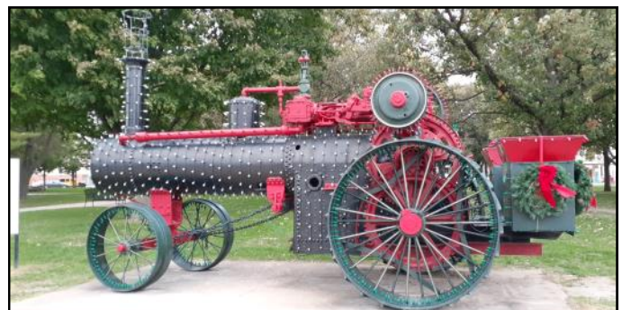
Above: In addition to lighting up the campground, Melinda Husinga and Linda Enearl bring the festivities to the Mount Pleasant Square and wrap the Nichols & Shepard steam engine in lights, some of which are in motion making the engine look like it steamed up and moving!