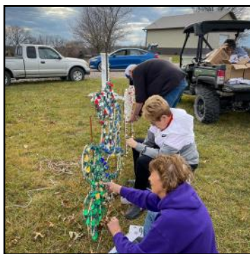
Volunteers log in many hours, not only staffing the Festival of Lights, but also setting up displays and changing out incandescent light bulbs with LED bulbs. December's warm weather made this a little more pleasant as the supply of light bulbs weren't delivered in a timely manner.