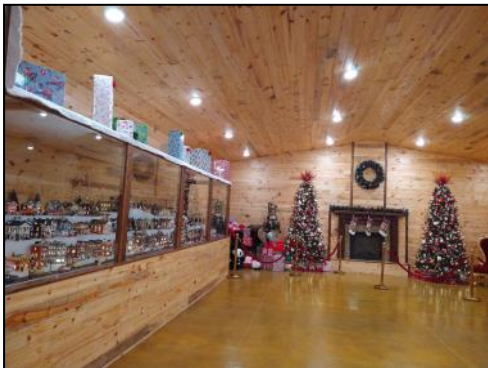
The new Santa House gives Santa's visitors a warm place to wait.