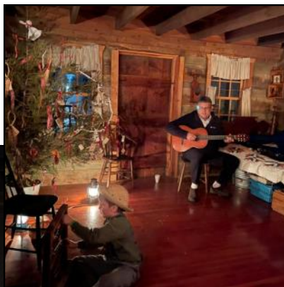
Left: The Log Village was open for the two rum/walk nights of the Festival of Lights. Visitors could either take the trolley to the Log Village or walk down the steps from the campground and enjoy hot cider and cookies in the Cassity House.