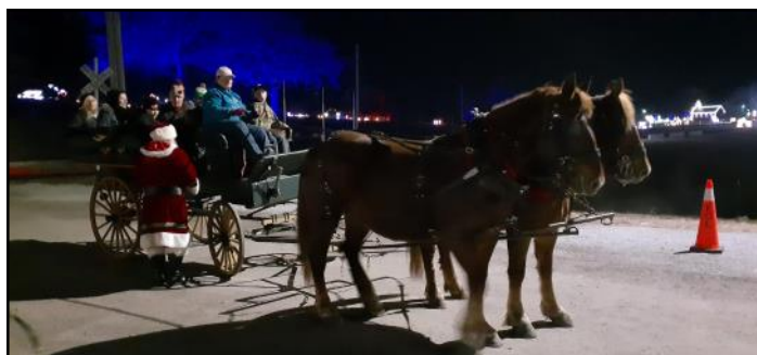
Above: Members of the OT Horse Area hitched up their teams of horses to give wagon rides through the Festival of Lights for two nights.