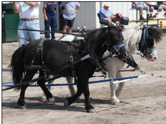
2024 Featured Horse "Miniature Horses"