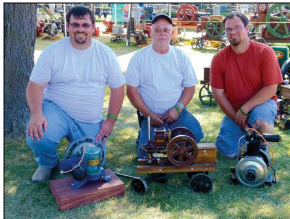
2024 Featured Antique Gas Engine Fractional Horsepower Gas Engines Owned by: Reynolds Family of Mt. Pleasant, IA