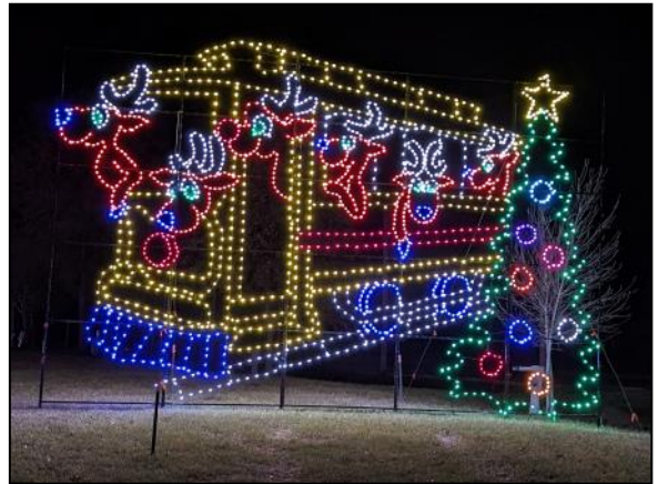
Pictured is one of the newest light displays. These reindeer are taking the ride of their lives on a trolley.

people from 65 Iowa counties and 40 states. Thank you to everyone who made this event possible, especially the sponsors. Thanks to a grant from the Enhance