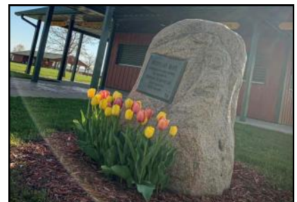
Tulips greet visitors to McMillan Park just outside the Paul Anderson Welcome Center.