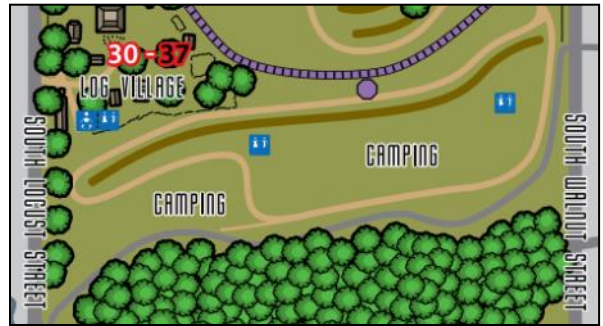
At right is a map that shows the south end of the OT Campground. The Campground Development Program will offer 70, 50 AMP, full hook-up campsites in this area.