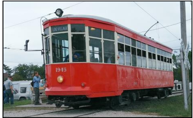
Pictured is the Milan Italy Car No. 1945. The car was built in 1927 and was brought to the Midwest Electric Railway in 2002.

The GOMACO Company, who is restoring 1779, have the shell of a Milan car just like what the Midwest Electric Railway has now. They will build out the mechanical systems and complete the finish carpentry for OT.