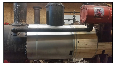
(Above) Aaron's latest project is making a jacket for the Advance. The pieces of wood act as insulation. After the sheet metal is cut and fitted it was painted a dark gray. (Below) The brass bands keep it in place.

Editor's Note: If you have a restoration story to share please contact Old Threshers at info@oldthreshers.org or call us at 319-385-8937.