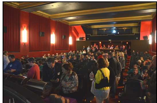
Mt. Pleasant Chamber Members fill the theatre at Main Street Cinemas on March 11th in anticipation of Old Threshers announcing the entertainment line-up for the 2015 Reunion.

Tickets for reserved seats in the Grandstand are on sale now at the Old Threshers office or by calling 319-385-8937. An adult five-day admission is $20 if bought by May 31st, $30 beginning June 1st so get yours now! Veteran's one-day admission on Thursday is $10.00. FFA and 4-H members get in for $10 any day of the Reunion. Be sure to wear your FFA or 4-H t-shirt. Kids 10 and under are free.