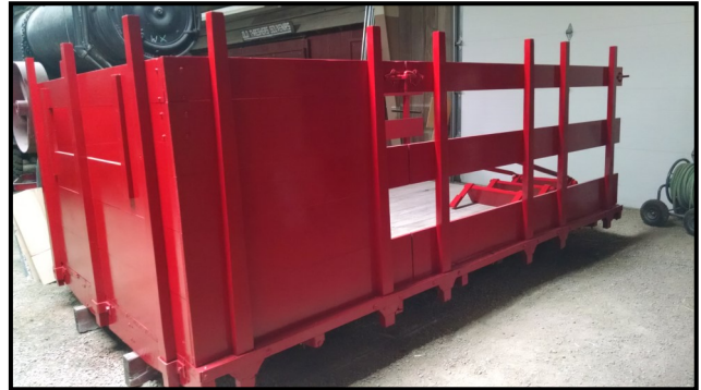
Above: The box for the Arledge Transfer truck has been repainted. The truck itself is in Burlington where students from Southeastern Community College are restoring the piece of transportation history. Below: The Standard sign is up and the fire truck waits for its spot in the display.

The construction of the exhibit is finished and the large artifacts are nearly complete but there is still a need for smaller things. If anyone has anything to donate that may have been sold at a Standard Station and would like to donate contact the Old Threshers Office at 319-385-8937.