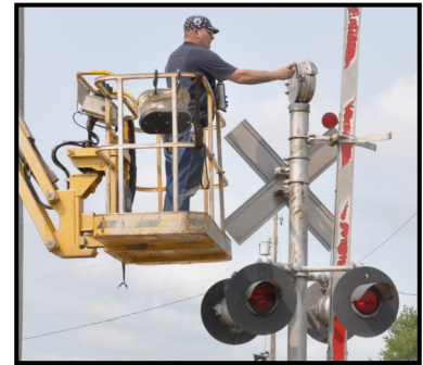
The Old Threshers grounds come alive weeks before the Reunion. There is much to do to get ready.