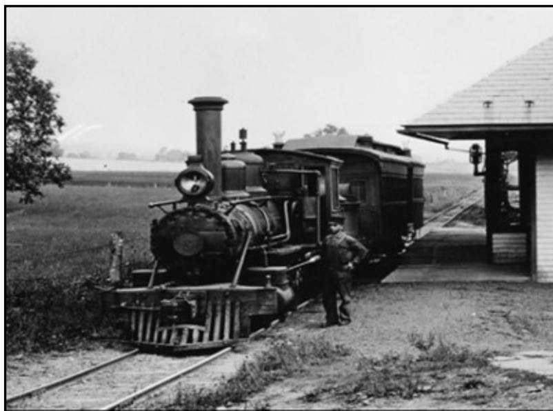
Left: #2 sitting at the NB&W's New Berlin station.

As always, we accept volunteers, and appreciate all the help we can get.