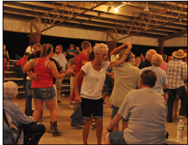
Reunion visitors dance the night away at the Dance Barn.

Whether you like country, gospel, rock, blues, dance, bluegrass or oldies there is something for you!