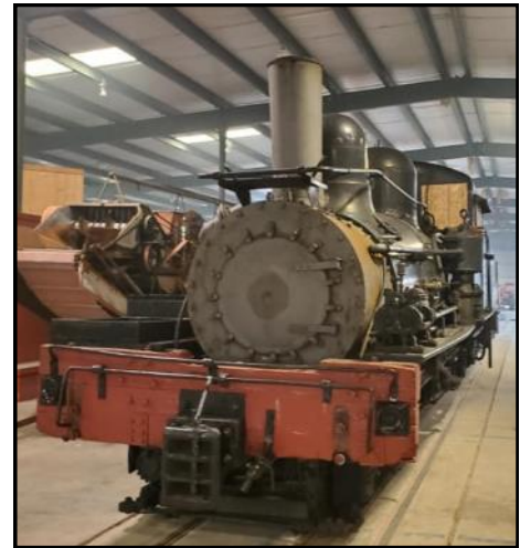
No. 9 sits in Heritage Museum B after making the trip from Colorado. It was boarded up and stripped down for the journey.

No. 9 was shipped to Iowa operational by flat car in 1966. With the exception of the past 8 years, it has operated here since then. For more information on No. 9 and other MCRR engines, go to www.mcrr.org .