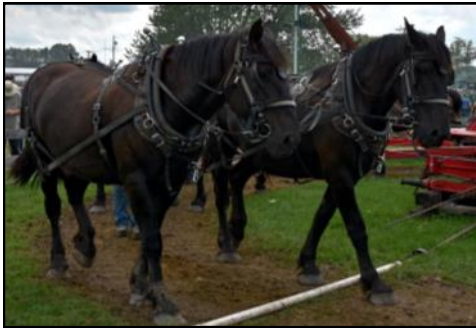
A team of Percheron draft horses on the horse-powered threshing machine at the 2018 Old Threshers Reunion.