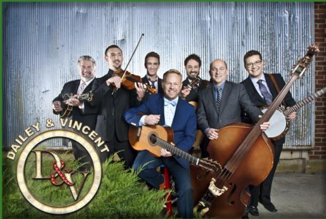
THURSDAY AUG. 29 - DAILEY & VINCENT