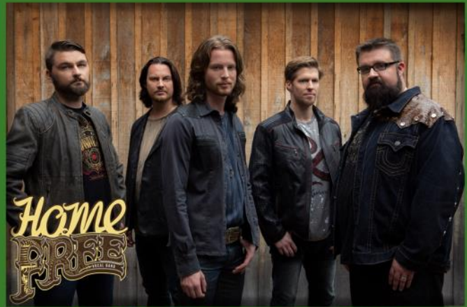
FRIDAY AUG. 30 - HOME FREE