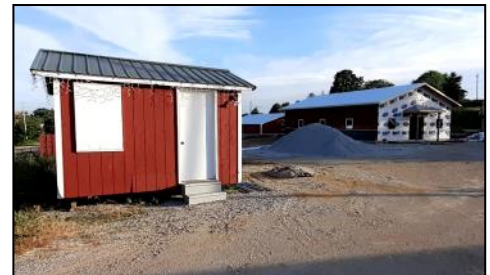
The old Santa House, in foreground, will be replaced by a much larger building allowing visitors to come in from the weather to greet Santa during Festival of Lights.