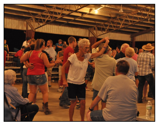
Reunion visitors dance the night away at the Dance Barn.

Whether you like country, gospel, rock, blues, dance, bluegrass or oldies there is something for you!