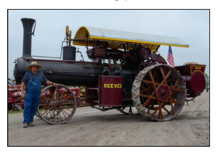
1915 20HP Reeves Owned by: Duane & Lana Wood Wallace, NE