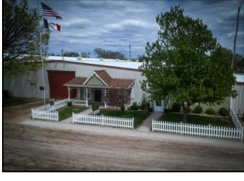
Then and now. The Old Threshers gift shop and offices have gone through a lot of changes over the years.