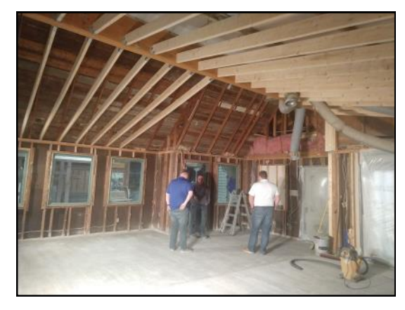
The OT gift shop was gutted to the studs while closed over the 2019 Holiday season.

While moving and sorting thousands of negatives and photographs, we ran across several that show the evolution of the office and gift shop.