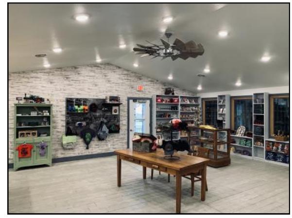
A new concrete floor, raised ceiling and better lighting are just a few of the improvements to the OT gift shop.