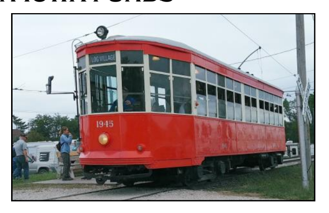
Pictured is the Milan Italy Car No. 1945. The car was built in 1927 and was brought to the Midwest Electric Railway in 2002.

At right is a map that shows the south end of the OT Campground. The Campground Development Program will offer 70, 50 AMP, full hook-up campsites in this area.