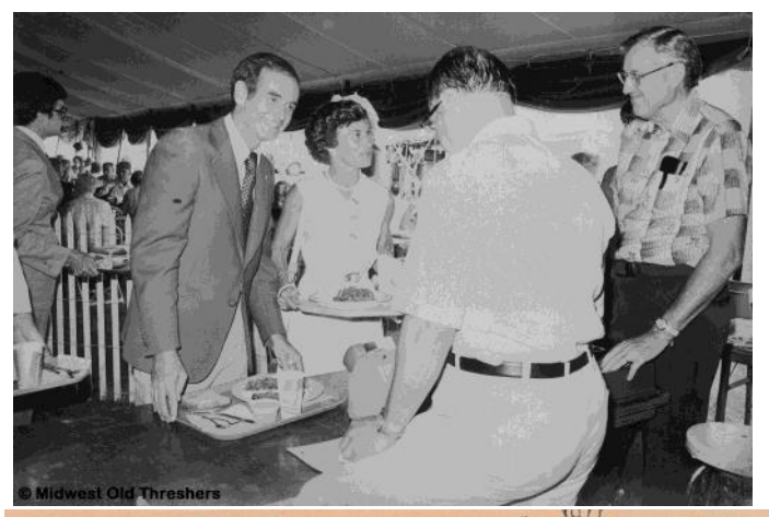
A buss for the governor

The Threshers Chaff began a quarterly publication schedule in 1973. The Marshalltown Corliss stationary steam engine was