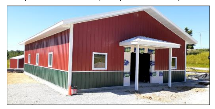
Located just inside the Campground gate, Santa's new house is waiting on a door. Santa's Workshop is just behind the house to the south.

As our 2021 Reunion visitors enter the campground from South Walnut Street, they will be greeted by two new red and green structures. Construction on Santa's House (pictured below) and Santa's Workshop is expected to be completed in