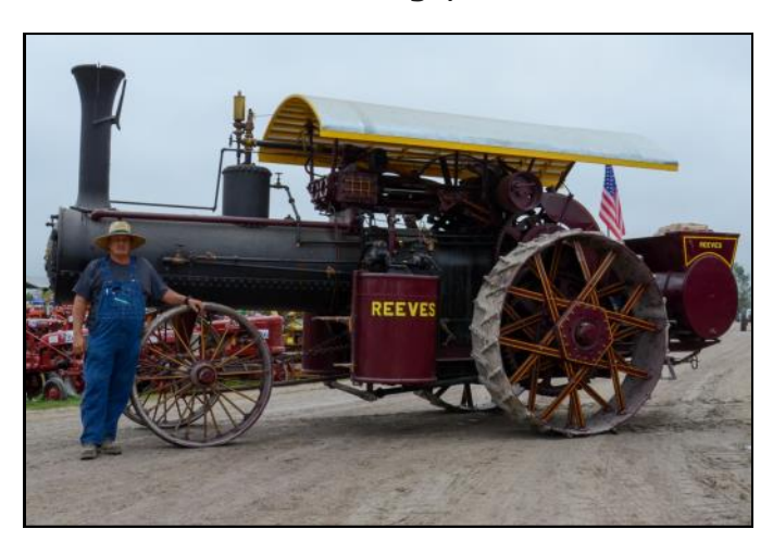
1915 20HP Reeves Owned by: Duane & Lana Wood Wallace, NE